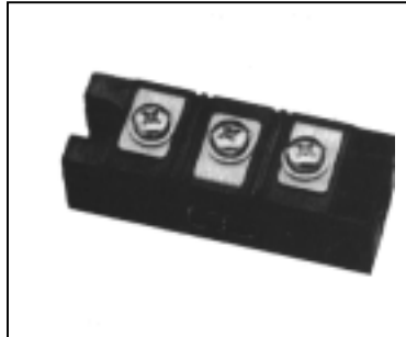
QIC0620003 Dual IGBT Module Common Emitter 200 Amperes / 600 Volts